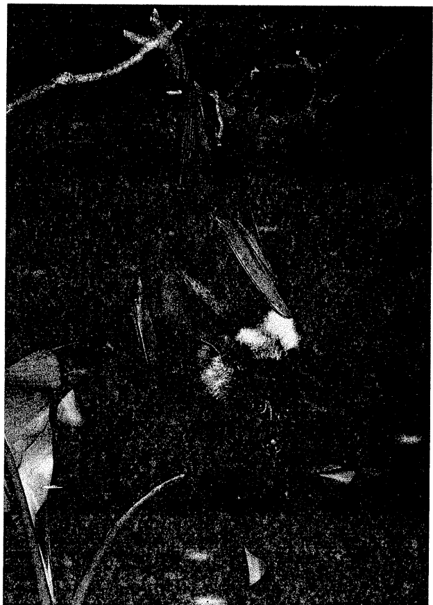
FIG. 1. Photograph of female Pteropus vampyrus from Indonesia, housed in captivity at The Lube Foundation, Inc., Gainesville, Florida.

GENERAL CHARACTERS. Pteropus vampyrus is one of the largest species of bat in the world and is noted for its dog- or foxlike face, a characteristic common to all flying foxes (Fig. 1; Medway, 1969; Rabor, 1977). P. vampyrus has no tail. Ears are long and pointed (Taylor, 1934). Hairs are short and stiff on upper back and longer and woolly on lower back, mantle, underparts, and sides. Hairs comprising the mantle are longer than those on other parts of the body (Lekagul and McNeely, 1977). Hairs on the venter have a crinkly and coarse appearance and extend halfway down the forearm (Rabor, 1977). Color and texture of pelage vary according to age and sex (Goodwin, 1979). Pelage of males seems to be slightly stiffer and thicker than pelage of females (Taylor, 1934). Males also may have glandular neck-tufts of stiffer fur, in which bases of hairs are darker than tips (Andersen, 1912). Immature specimens often are uniformly dull gray-brown (Payne et al., 1985). Young P. vampyrus are born with a dark-colored mantle that in males may become lighter in color upon maturity (Taylor, 1934).